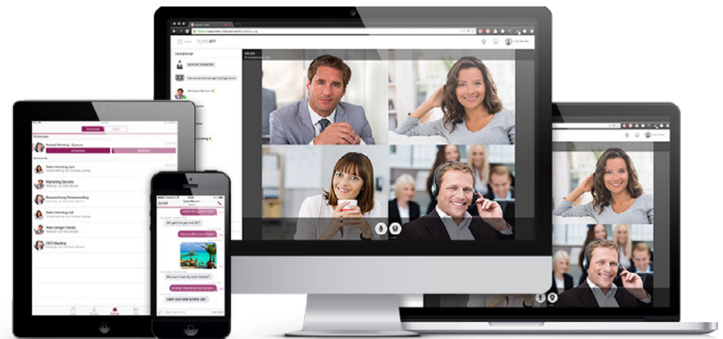
eyeson Single Stream connects all devices