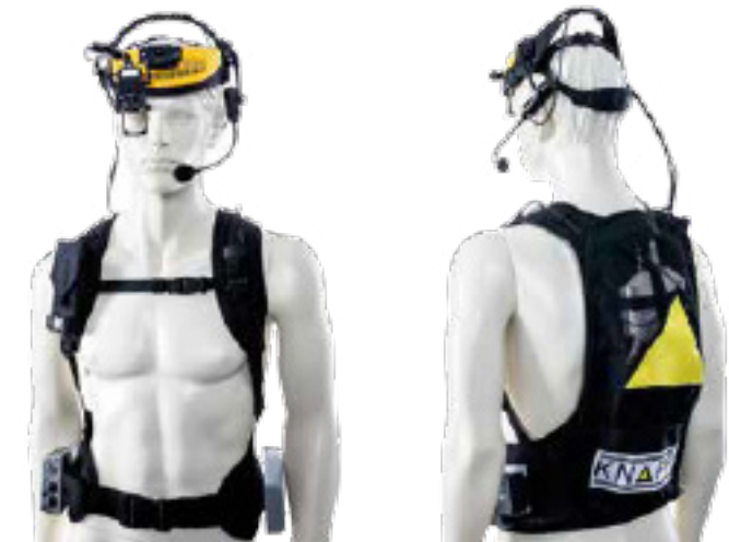
ivii.assist – ivii GmbH Member of KNAPP AG